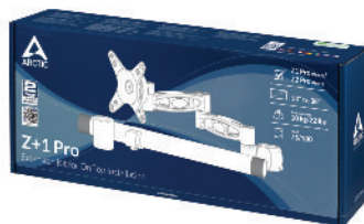
Z+1 Pro Pole